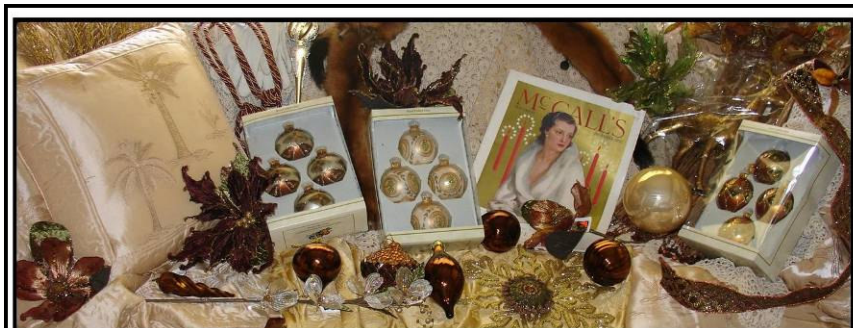
Ornaments and Accessories for Dorothy's Room

American editor, author, and philanthropist. He probably was best known for being the editor of Ladies Home Journal and under his leadership the magazine was the first magazine in the world to have one million subscribers.